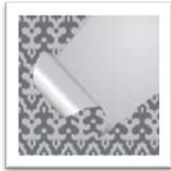
Remove old wallcovering.