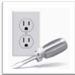
Remove picture hooks, light fixtures, switch plates & outlet plates.