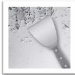
Remove flaking paint