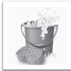
Remove old paste, grease & dirt with a warm, mild detergent solution. Rinse Well.