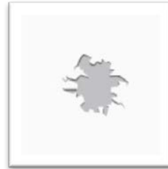
Repair any defects in the wall surface & patch any nail holes.