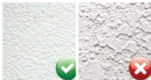
"Orange peel" "Knock Down"

Avoid applying your mural to raw sheetrock or concrete. You can apply your mural to a concrete wall, but the wall will first need two coats of satin or semi-gloss paint.